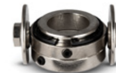
CUTTING BUGGY SKU: WGSC2551

The UNIMIG Standoff Guides keep distance between your plasma torch and the workpiece, extending consumable life.