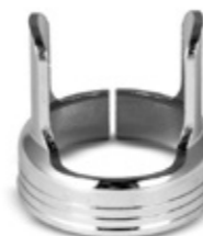
STANDOFF GUIDE SKU: WGSC2540