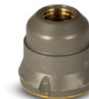
RETAINING CAP SKU: WGSC2530